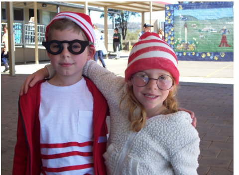
CAWDOR PS STATEMENT OF PURPOSE: