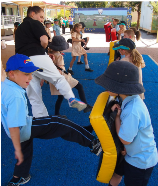
K-2 at Martial Arts last Thursday