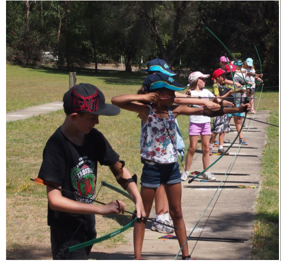
Snapshots of Cawdor..... At Wooglemai