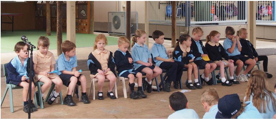
Kindergarten girls and boys did a wonderful job running the Assembly on Wednesday 28 October